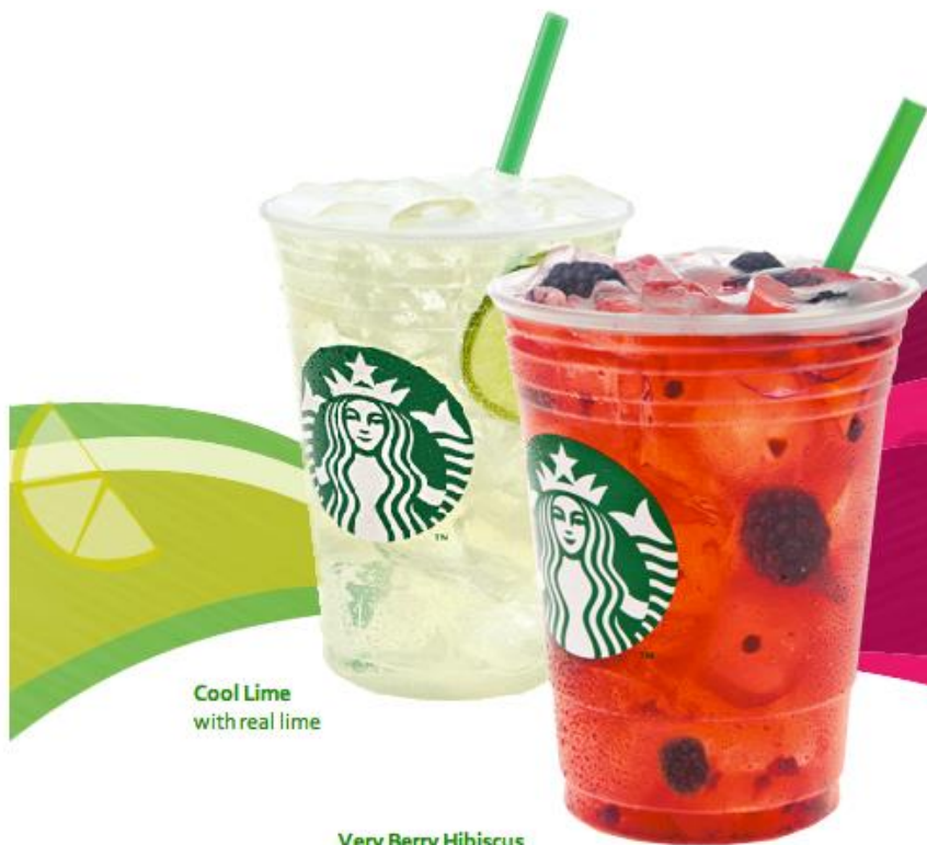
Cool Lime with real lime