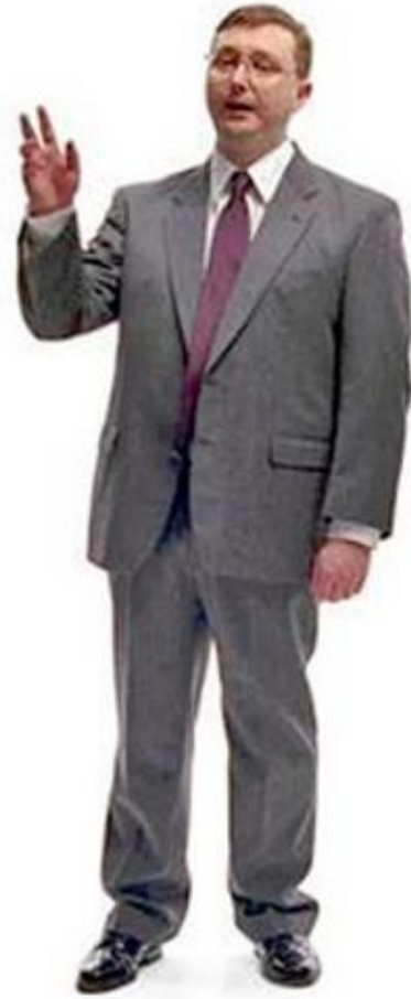
I'm a PC.