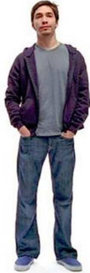
I'm a Mac.